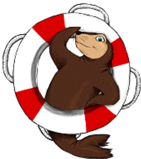
"Seal "